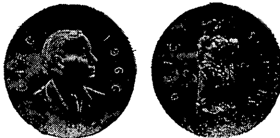
ANNIVERSARY—Obverse (left) and reverse of the 10-shilling coin issued to mark 1916 Irish rebellion.

The 10-shilling ($1.40) coin is legal tender. It is a fine (83 per cent) silver alloy, and is available from the Secretary of the Central Bank of Ireland, Dublin 2. The price of an ordinary uncirculated coin piece is 12/6 or $ 1.80, which includes surface mail postage. A limited issue of 20,000 proof coins is being struck. The price of a proof, including a presentation case and sea-mail postage is 32/6 or $4.60