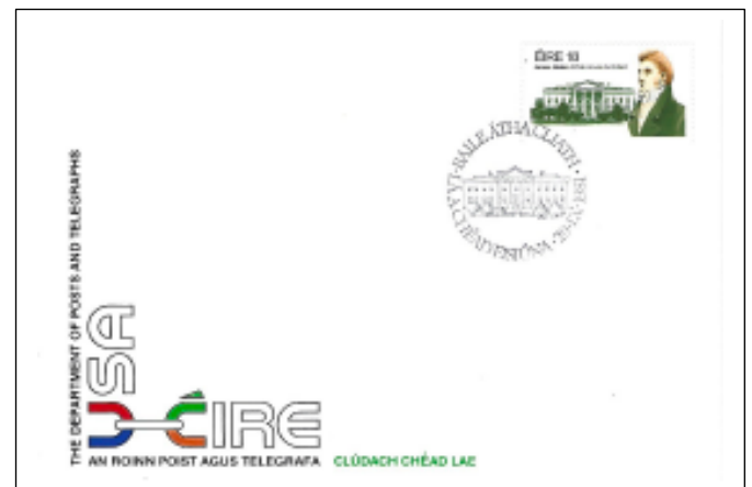
Official Irish cover cancelled in Dublin.