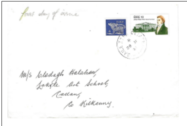
Dublin to Callan without official cancellation